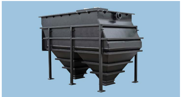
Rectangular SK-tank unit