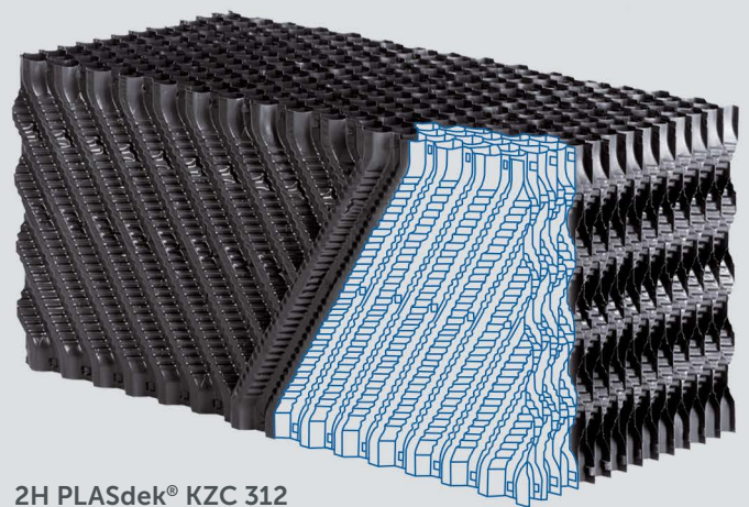
2H PLASdek® KZC 312

In the manufacturing process we developed the foils are reinforced at the outer edges and in the middle and are therefore very stable. This makes our film fill media extraordinarily resistant to erosion.